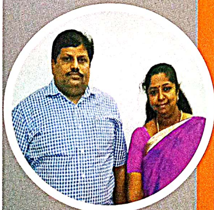
Secretary Vice Chairman